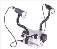
Light & Motion Used Here

NASA Langley Data Ctr Japan Aerospace Agency Biosphere Globe Near Earth Objects